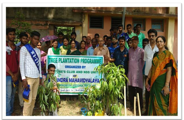
Tree plantation week organised by Nature's Club and NSS Units