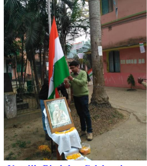
Netaji's Birthday Celebration at College