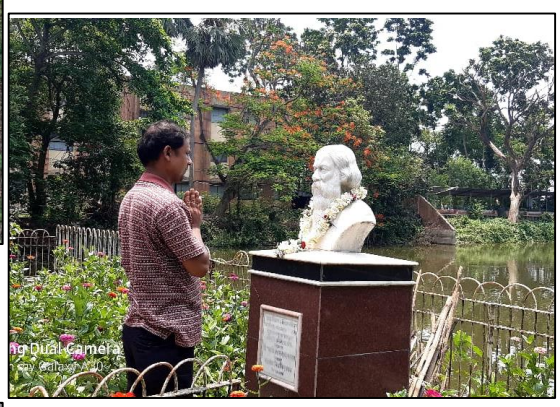
Birthday Celebration of Rabindranath Tagore at College