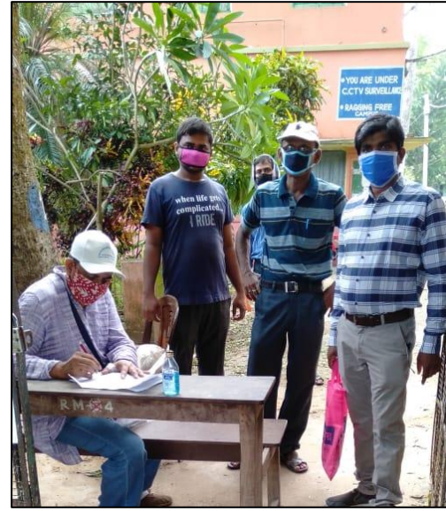
COVID Awareness Programme organized by the College